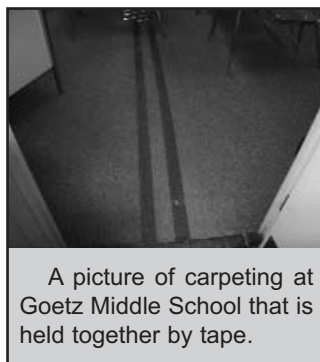
A picture of carpeting at Goetz Middle School that is held together by tape.