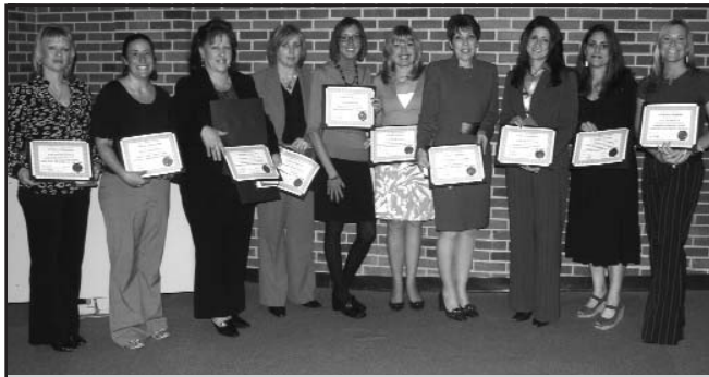
The Jackson School District Teachers of the Year were recognized by the Board of Education on March 31. The teachers were also presented with gift certificates from the Jackson Educational Foundation.