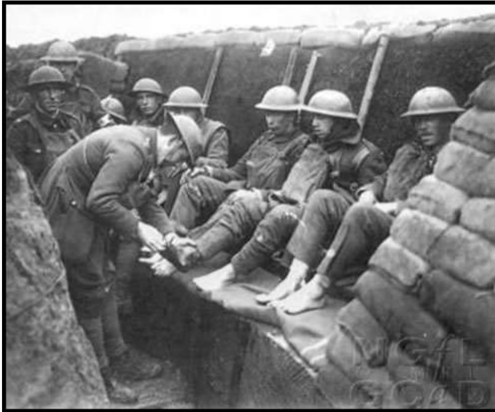
Soldiers being inspected for signs of Trench Foot