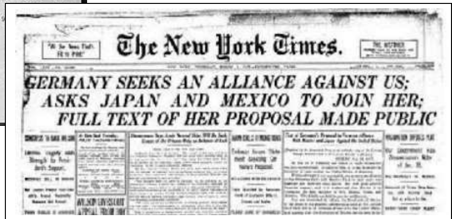
Original coded message of the Zimmerman Telegram