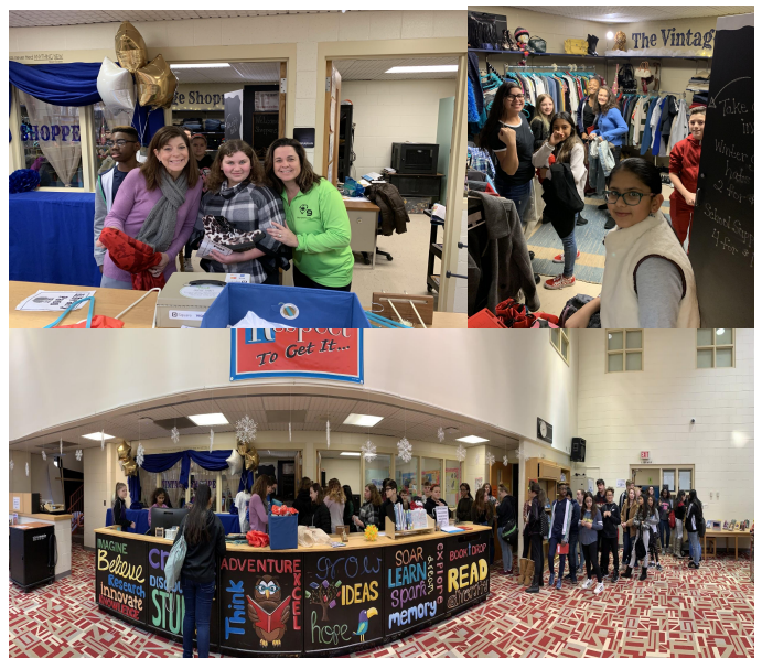
Shown above: Opening Day at the Vintage Shoppe

If you haven't checked out the Vintage Shoppe yet, be sure to stop by the IMC to see for yourself.