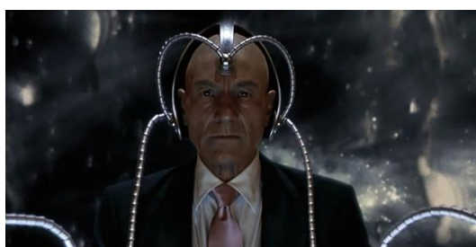
Patrick Stewart as Professor Charles Xavier in the X-Men movie franchise.