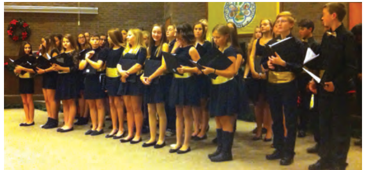
The Goetz Honors Choir sang for the Jackson Township 10th Annual Menorah Lighting Ceremony on December 9th, 2015 at the Jackson Township Municipal Building.