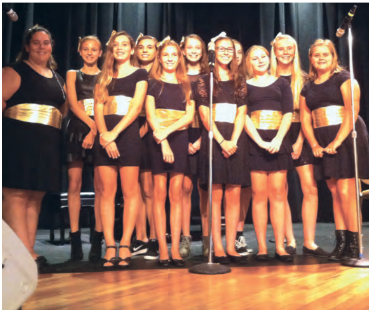
Goetz Honors Choir students performed at Westlake at the 9/11 ceremony held there in September.