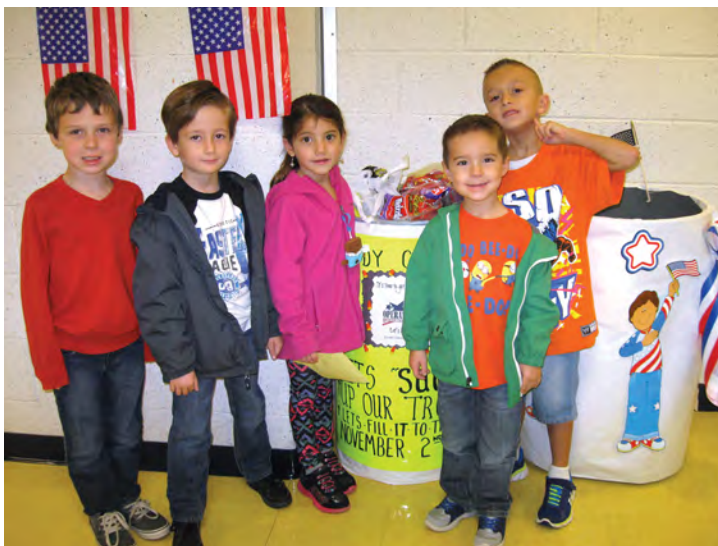
Elms Elementary School Girl Scouts collected "leftover" Halloween candy for our servicemen and women. Some kindergarten and first grade students helping with the effort.