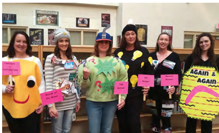
Sixth Grade Literacy teachers at McAuliffe Middle School dress up as the 'Literary Sign Posts' for Halloween. ■

This election year, children at Switlik decided between Democratic nominee Hillary Clinton or Republican nominee Donald Trump to be selected as the next president of the United States. Our results are in and the winner of the Switlik School Mock Presidential Election is Donald Trump! ■