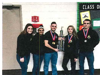
Air Rifle Marksmanship Team