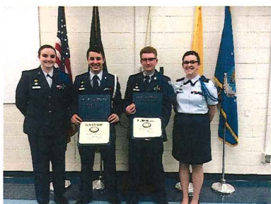
Kitty Hawk Air Society Inductees