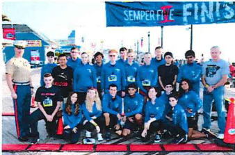
Marine Corps Semper 5K Run