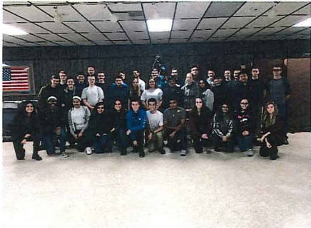
Commission for the Disabled Holiday Dinner