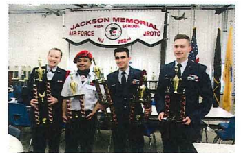
Drill Team Commanders