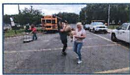
THANKS TO EVERYONE FOR MAKING THIS WORK