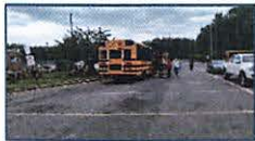
Remote deliveries by our transportation staff