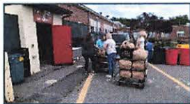
Loading up the meals